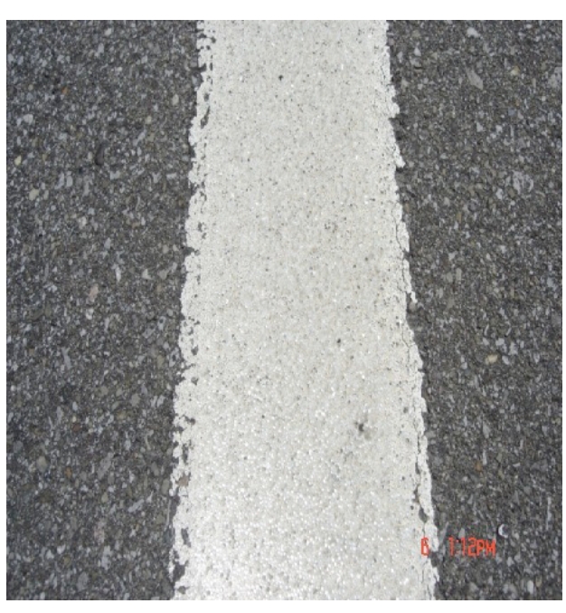
Original line after 22 months of service.