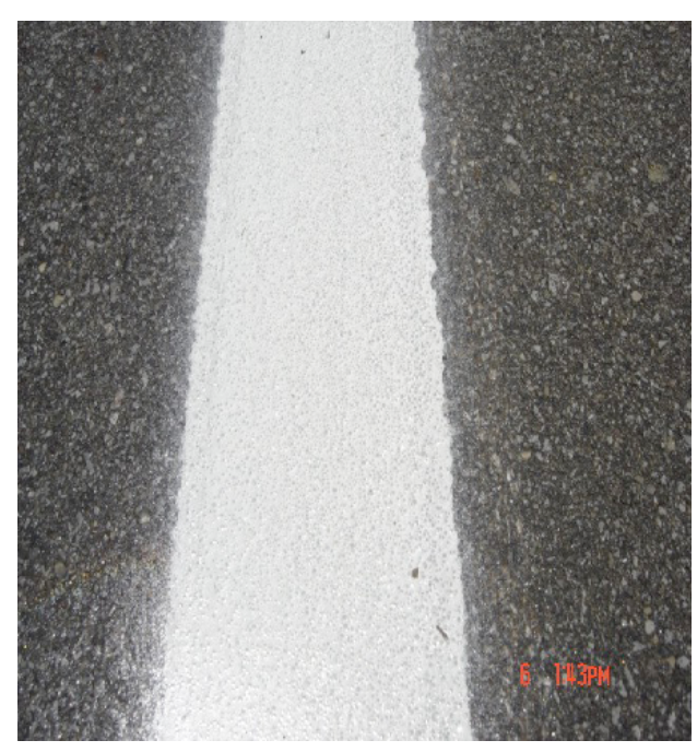
New line after partial removal